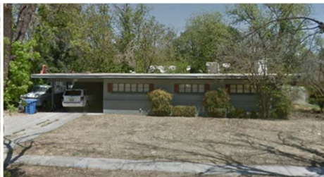
704 Lakeside – address in 1958.