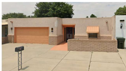
What I think is their final house at 1509 Live Oak Place at the Riverside Country Club in Carlsbad.

I'm going to let this biography from the celebration of their 50 th wedding anniversary add color to their lives.