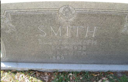
Gravestones from Findagrave.