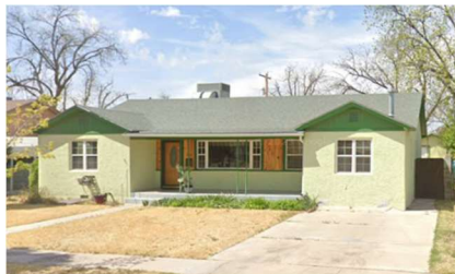
1005 N. Thomas, Carlsbad – address in 1954.